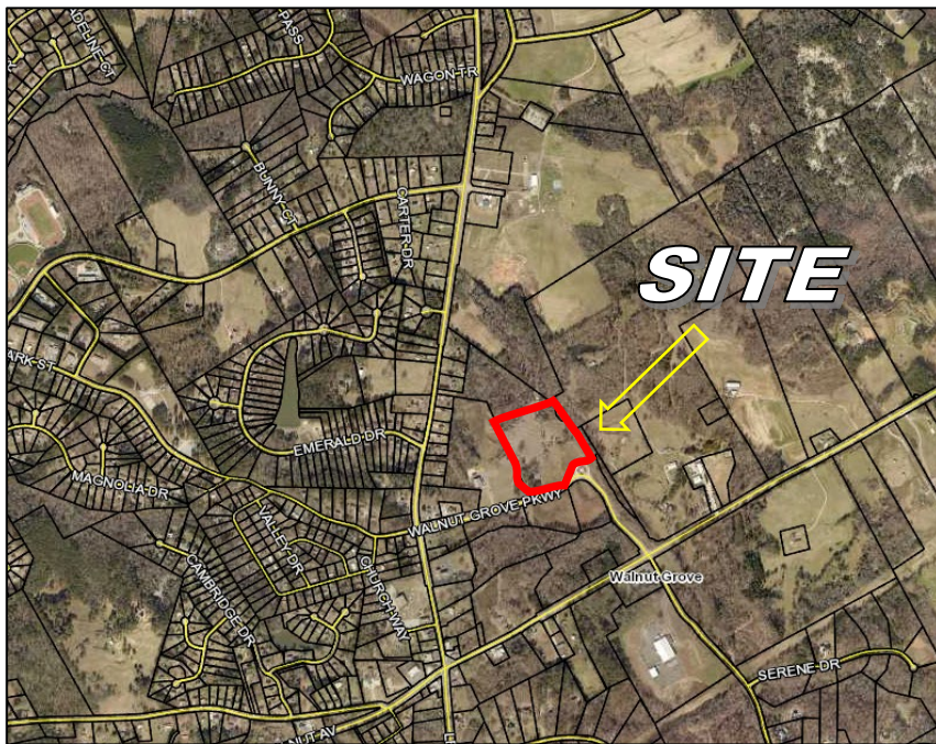
Walnut Grove Zoning Map